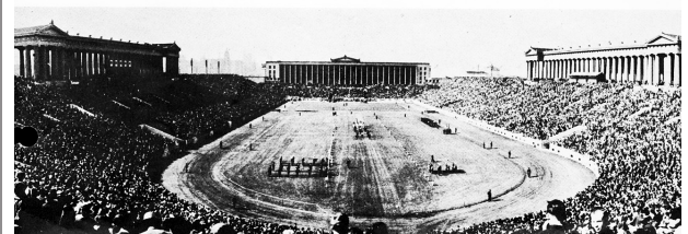
An advertisement in the USET Newsletter announcing the 1959 Pan American Games in Chicago, Ill. This is where the first USCTA meeting took place.